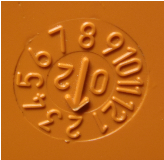
Figure 1 view of manufactures date stamp

For example below, the arrow points to "2" and the number is "02" means that the helmet was manufactured in February and the year is 2002.